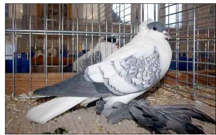
Saxon Fullhead Swallow Blue Spangel Rated E-97, H.-Ulrich Lemnitz Photo from Zwönitz 2012 by Andreas Reuter