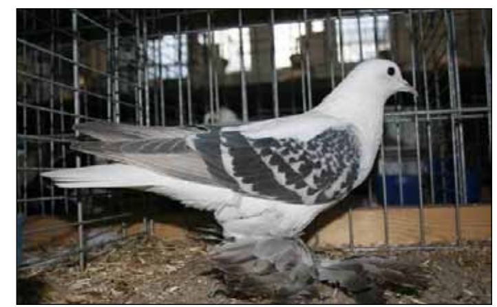
Saxon Silesian Swallow Silver Checker Rated E-97, Dieter Junghänel Photo from Zwönitz 2012 by Andreas Reuter