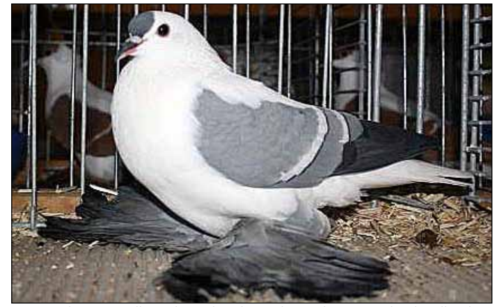
Saxon Silesian Swallow Blue White barred Rated E-97, Michael Gallasch Photo from Zwönitz 2012 by Andreas Reuter