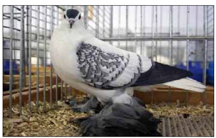
Saxon Silesian Swallow Blue Spangle Rated HS-96, Bernd Ehrler Photo from Zwönitz 2012 by Andreas Reuter