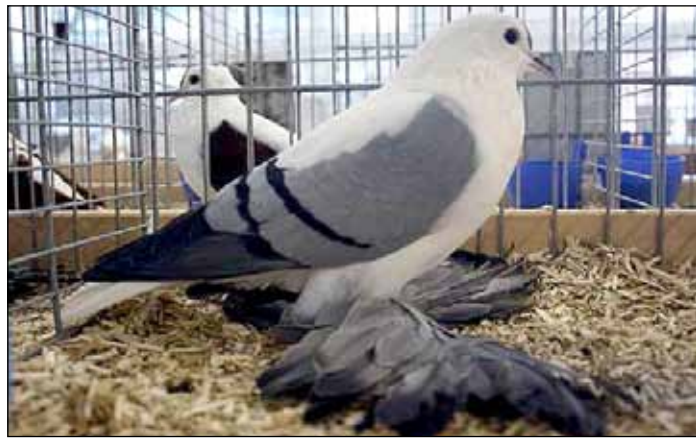
Saxon Silesian Swallow Blue black barred Rated E-97, Bernd Ehrler Photo from Zwönitz 2012 by Andreas Reuter