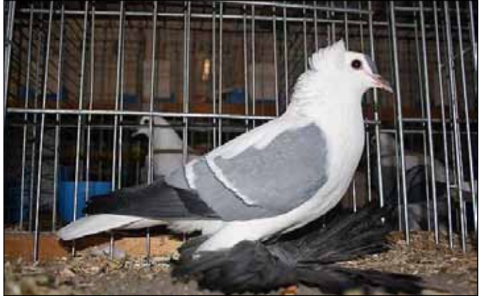
Saxon Fairy Swallow Blue White bar Rated E-97, Cor van der Post Photo from Zwönitz 2012 by Andreas Reuter