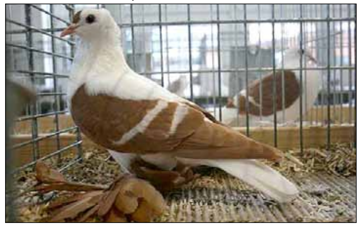
Saxon Fairy Swallow Yellow White barred Rated E-97, Stephan Groschupp Photo from Zwönitz 2012 by Andreas Reuter