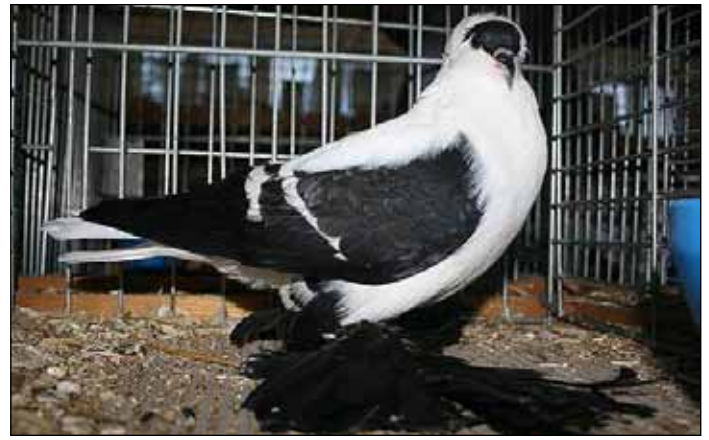
Saxon Fullhead Swallow Black White bar Rated HS-96, Klaus Hentschel Photo from Zwönitz 2012 by Andreas Reuter