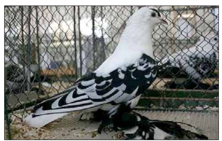
Bohemian Tiger Crested Swallow, Black Rated E-97, Franz Oppl Photo from Zwönitz 2012 by Andreas Reuter