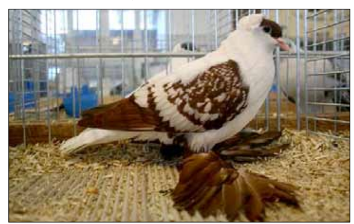
Saxon Fullhead Swallow Red Spangle Rated S-94, Klaus Hentschel Photo from Zwönitz 2012 by Andreas Reuter