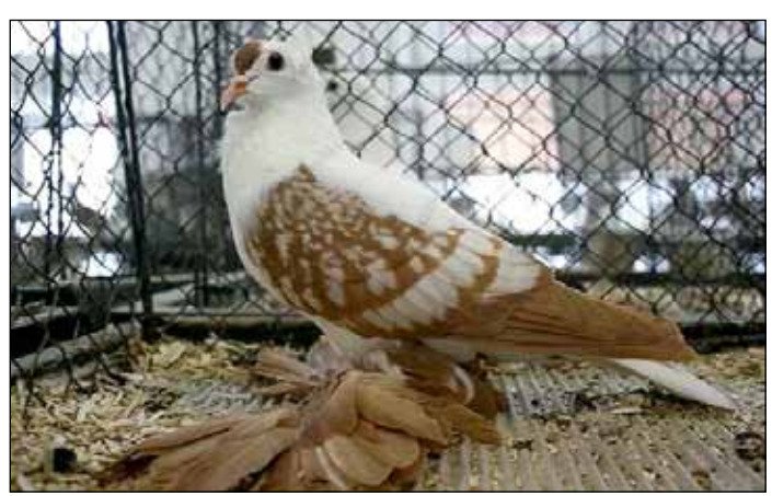
Saxon Fairy Swallow Yellow Spangle Rated E-97, Klaus Burkhardt Photo from Zwönitz 2012 by Andreas Reuter