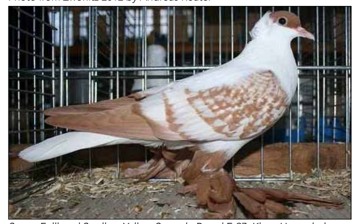
Saxon Fullhead Swallow Yellow Spangle Rated E-97, Klaus Hentschel Photo from Zwönitz 2012 by Andreas Reuter