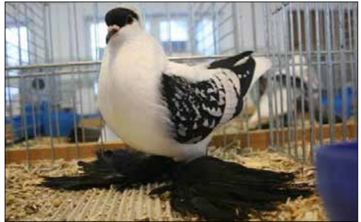
Saxon Fullhead Swallow Black Spangle Rated S-95, Klaus Hentschel Photo from Zwönitz 2012 by Andreas Reuter