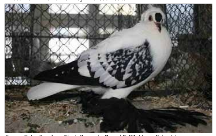
Saxon Fairy Swallow Black Spangle Rated E-97, Horst Schmidt Photo from Zwönitz 2012 by Andreas Reuter